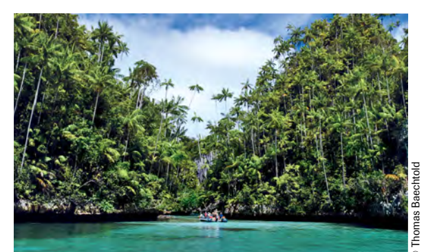
▲ West Papau, Indonesia