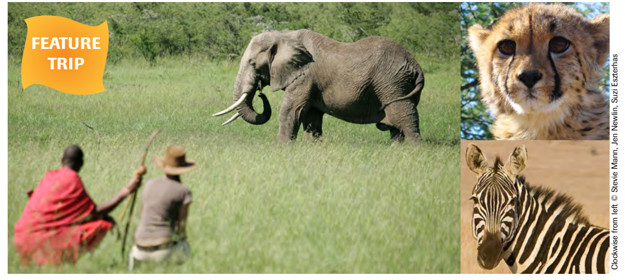
▲ Elephants, cheetahs and zebras are among several animals you'll see during our African safari across Kenya.