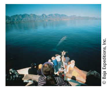
Sea of Cortez Wildlife Cruise

Peninsula. From the Resurrection Bay town of Seward, we'll take a boat to the glaciers and seabird cliffs of Kenai Fjords National Park (below), accompanied by sea otters, Dall's porpoises and — with luck — orcas and humpback whales. During our drive to the Kachemak Bay town of Homer, we'll explore the Kenai Mountains on a short raft trip. Next, we'll venture across Cook Inlet on a grizzly bear viewing fly-and-hike day trip, boat to the south side of the bay to walk intertidal and forest trails, and spend an evening in the artist village of Halibut Cove. Hikes to Exit Glacier and a Nature Conservancy Aleutian tern colony, plus a visit to the Alaska SeaLife Center, round out this nine-day natural history adventure. ($300)