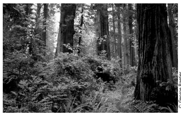
Prairie Creek Redwoods State Park, California

conservation sites protected with the Conservancy's help. A pelagic boat trip offers the opportunity to see black-footed albatrosses, fulmars, shearwaters and other birds rarely seen from land. ($100)