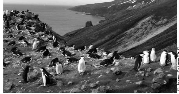
A colony of chinstrap penguins, Deception Island, Antarctica

ing for salmon in the estuaries, and a unique coastal subspecies of gray wolf. Local native Gitga'at guides will share their knowledge, and you will travel in safety and comfort aboard Bluewater Adventure's 68-foot Island Roamer.