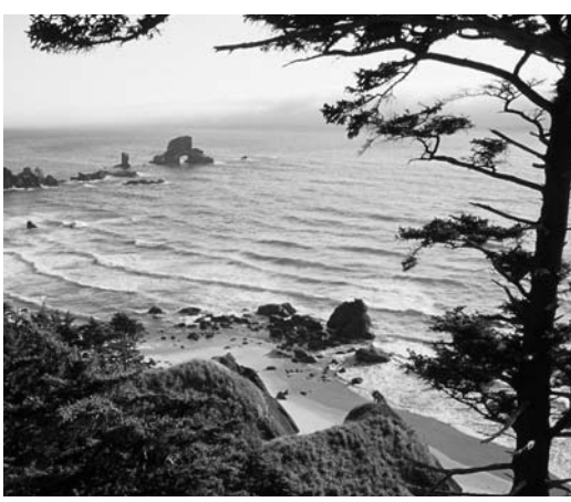
Ecola State Park, "the grandest and most pleasing prospect" ever surveyed by Lewis and Clark

Laughing falcons are one of over 500 bird species seen during Mexico's famed Veracruz River migration.